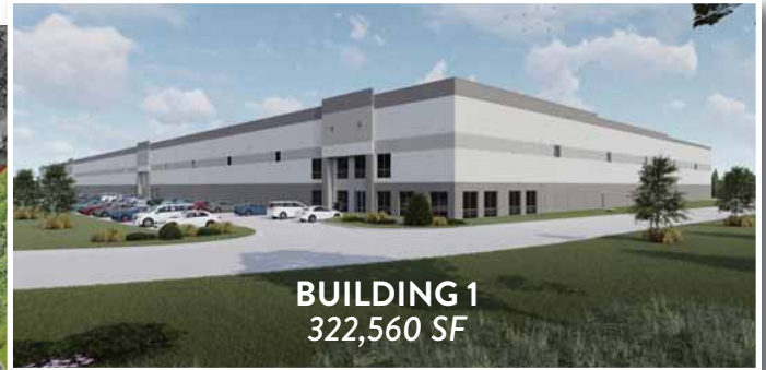
BUILDING 1 322,560 SF